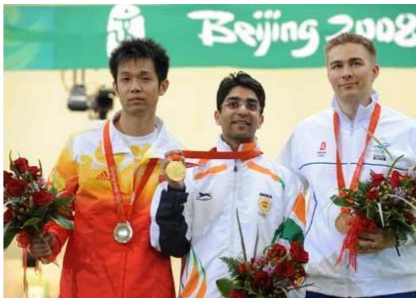
Shri Abhinav Bindra (in Centre) with Gold Medal

Indian Shooter Shri Abhinav Bindra created history by winning India's first ever Olympic Gold Medal in an individual event. Shri Bindra defeated China's Zhu Qinan, Gold Medalist of Athens 2004, in the finals of 10 meters Air Rifle by scoring 700.5 points for the title. Since the time he won Gold Medal at the World Championship in 2006, Sh Bindra was being seen as strong contestant for the medal at the Olympics. The Government had given him full financial support, amounting to Rs. 35.00 lakhs for his individualized training in India and abroad under a dedicated coach. Earlier also the Government had given him financial assistance of around Rs 60 Lakhs spread over a period of 4-5 years.