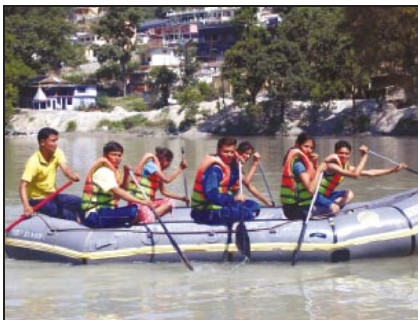
NSS volunteers during river rafting in Uttarkashi as a part of Rajiv Gandhi Adventure Scheme.

With a view to promote adventure activities among student youth, Rajiv Gandhi Adventure Scheme was launched on 26 th June, 2009 to be conducted all over the country from Himalayan Region in the North and to Kunnoor and Tekkadi in South India; on a yearly basis for 2000 NSS Volunteers with at least 50% of the volunteers being girl students. The adventure activities being undertaken in these camps include trekking (mountain and desert), white water rafting, para-sailing, para-gliding and basic skiing.