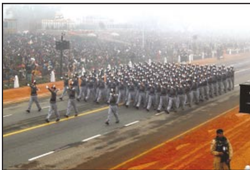
Marching on the Rajpath on Republic Day – Every NSS Volunteer’s dream.

NSS volunteers participate in the Republic Day Parade on Rajpath every year. To select the marching contingent, 5 pre- Republic Day Parade Camps were organized at Sikkim, Trichy, Kota, Bhopal and Ropar. One thousand NSS Volunteers (after initial selection) and NSS Programme Officers participated in these camps. Out of the 1000 volunteers, 200 volunteers were finally selected to take part in the month long Republic Day Camp at New Delhi in January.