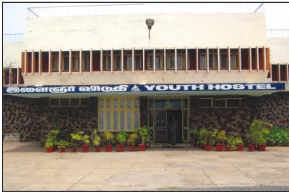
Youth Hostel Pondicherry

The Ministry is also working towards giving the existing youth hostels a new look and new working system to meet the expectation of today's youth.