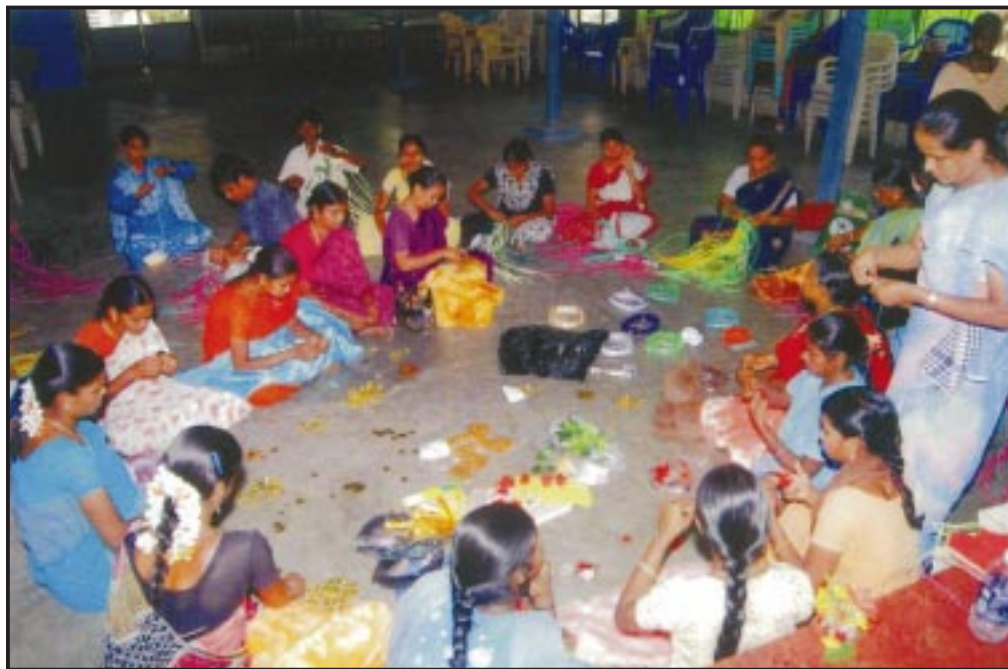
Youth Leadership Personality Development and Skill Development Training Programme

Nehru Yuva Kendra Sangathan is implementing Adolescent Health & Development Project with the support of UNFPA in 64 Districts in 31 States all over the country. Under this project, various adolescent development programmes have been undertaken for 3824 teen clubs. The teen clubs work towards creating awareness and building life skills of the adolescents that enable them make the right choices in life.