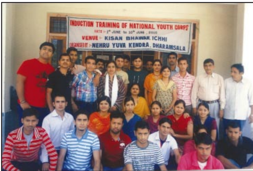
Participants of Induction Training of National Youth Corps of NYK dharamsala

The basic through its various programmes, NYKS attempts to bring forth the youth in the mainstream of national development as active participants, responsible and productive citizens of