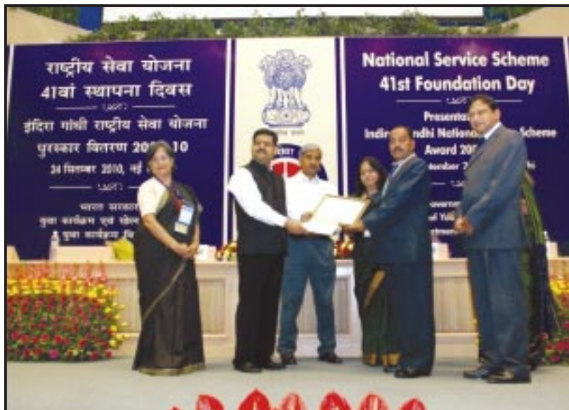
Hon'ble Minister of State for Youth Affairs & Sports Shri Pratik Prakashbapu Patil giving away the Indira Gandhi NSS Awards during NSS Foundation Day Celebrations.

2010 during the NSS Foundation Day celebration. It has also been decided to increase the number of awards. The awards for the year 2010-11 will be presented to 10 NSS Units/Programme Officers instead of six and 30 NSS Volunteers instead of the present number of 16.