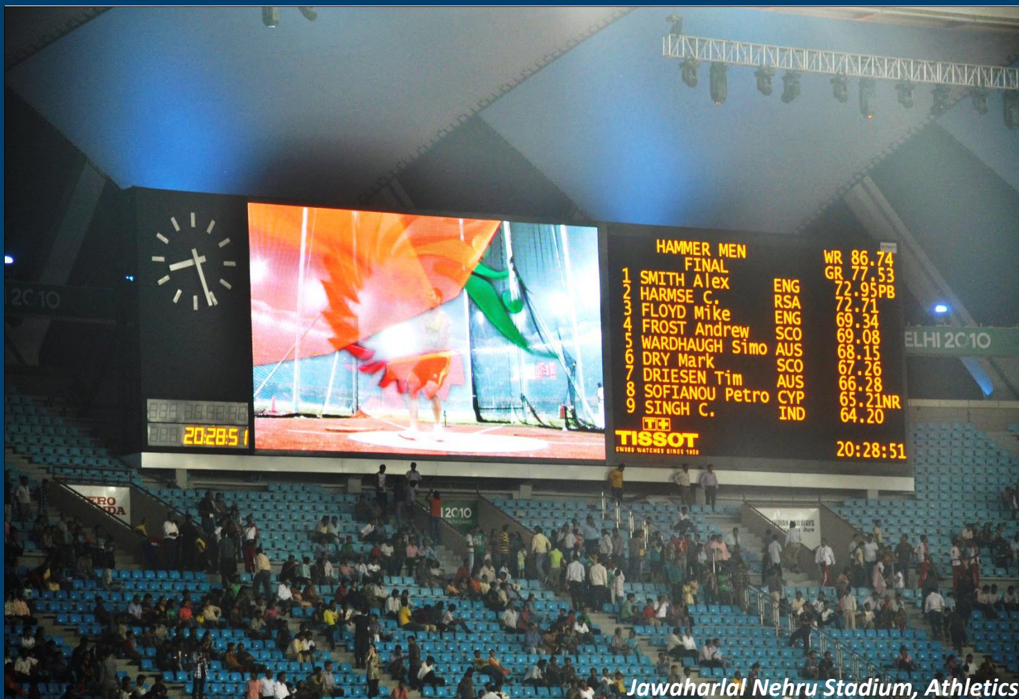
Jawaharlal Nehru Stadium, Athletics

GOVERNMENT OF INDIA | MINISTRY OF YOUTH AFFAIRS AND SPORTS