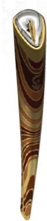
Figure 5 : Queen's Baton

The Queen's Baton Relay is one of the great traditions of the Commonwealth Games. Queen's Baton Relays have been the curtain raiser to every Commonwealth Games since 1958. The Queen's Baton Relay 2010 Delhi commenced when Her Majesty Queen Elizabeth II, Head of the Commonwealth, in the august presence of Smt. Pratibha Devisingh Patil, President of India and Dr. M.S. Gill, Minister of Youth Affairs and Sports entrusted the baton containing her message to the first Baton bearer at Buckingham Palace on 29 October, 2009. The baton will travel in excess of 190,000 kilometers over a 340 day period; this will make the Delhi 2010 Queen's Baton Relay one of the longest relays in the history of the Commonwealth Games. The baton will journey 170,000 kilometers for 240 days in the international sector, comprising 70 nations and territories of the Commonwealth. The Baton will enter India at the Wagah Border on 25th June, 2010. On its 100 day national tour, the baton will visit every Indian state and its capital, plus many other cities along the way, covering in excess of 20,000