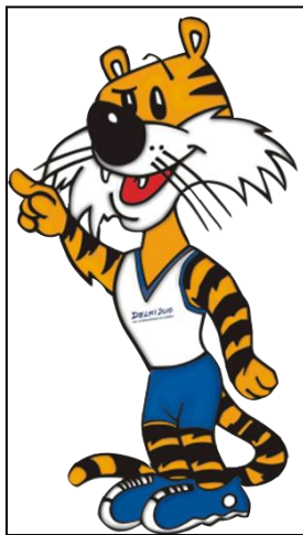
Figure 3 : CWG Mascot

Logo: The logo for the XIX Commonwealth Games 2010 Delhi is inspired by Chakra. The wheel of time and circle of life, has always inspired the nation as a symbol of freedom, unity, energy and power. It is a manifestation of the dynamic, spiraling energies of a proud nation. It takes on a new meaning today as it transforms into a modern idiom depicting a vibrant, resurgent India. It symbolizes India reaching out to the world.