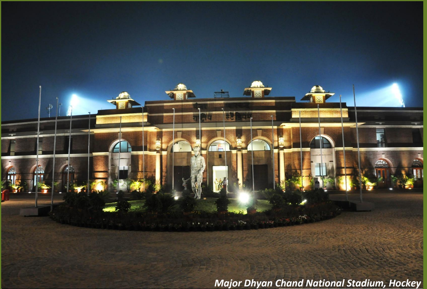
Major Dhyan Chand National Stadium, Hockey

GOVERNMENT OF INDIA | MINISTRY OF YOUTH AFFAIRS AND SPORTS