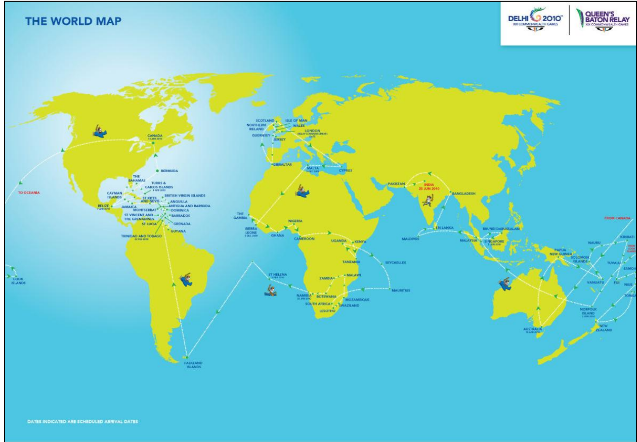
Figure 6 : International Tour - Queen's Baton Relay