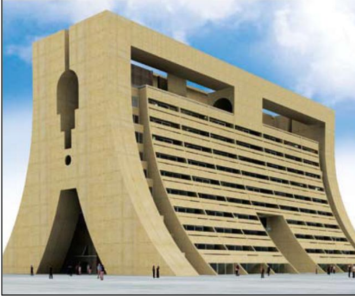
Figure 4 : OC Headquarters in Delhi

The Indian Olympic Association (IOA), the CGA of India, with the support of Govt. of India & Govt. of Delhi, submitted a bid to host the 2010 Commonwealth Games in May 2003 to the CGF in London