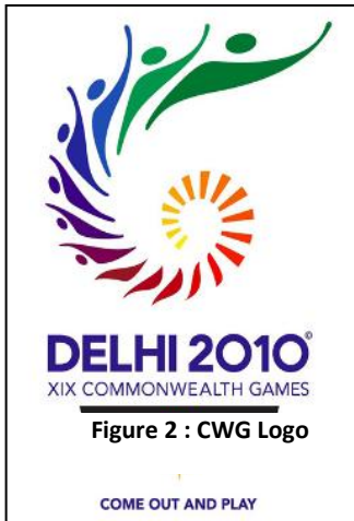
Figure 2 : CWG Logo

Logo: The logo for the XIX Commonwealth Games 2010 Delhi is inspired by Chakra. The wheel of time and circle of life, has always inspired the nation as a symbol of freedom, unity, energy and power. It is a manifestation of the dynamic, spiraling energies of a proud nation. It takes on a new meaning today as it transforms into a modern idiom depicting a vibrant, resurgent India. It symbolizes India reaching out to the world.