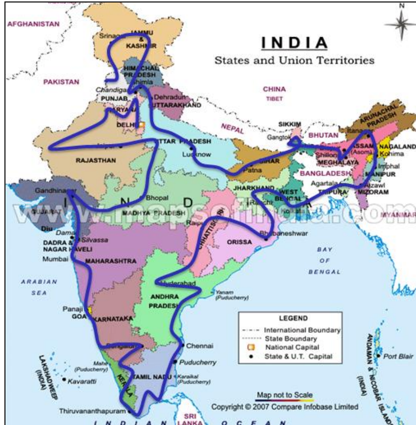
Figure 7 : National Tour - Queen's Baton Relay

The Baton plans to arrive in India through Wagah Border (crossing between India and Pakistan) on 25 June 2010. It will then commence a 100 Days National tour visiting 28 States and 7 Union Territories of India.